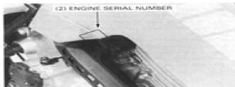
The engine serial number is stamped on the upper side of the right crankcase.