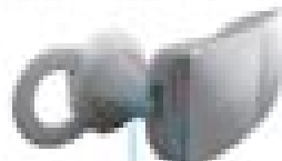
Microphone Tail Button