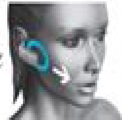
Wig, Stretch, Secure

Jawbone ICON works regardless of position, but you will get the best performance if the Icon Airway feature physically secures your eardrum.