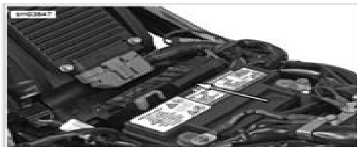
Figure 8-10. Fuse Block Cover (All Except FXCW/C)