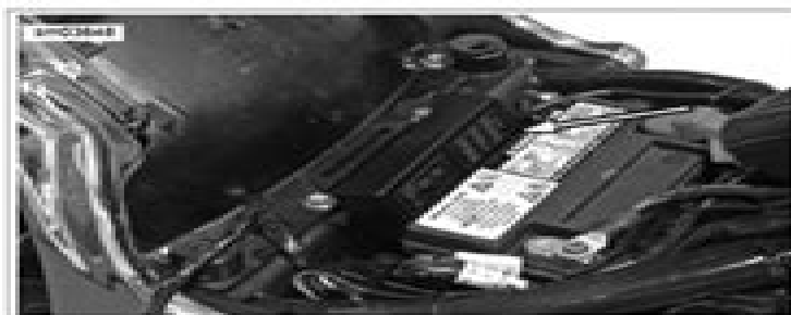
Figure 8-11. Fuse Block Cover (FXCW/C)