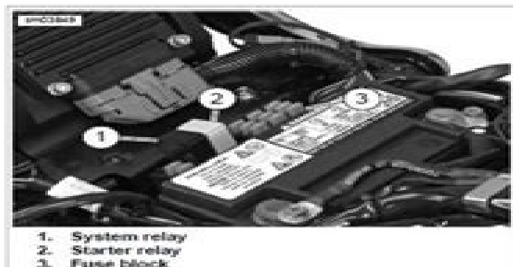
Figure 8-9. Fuse Block