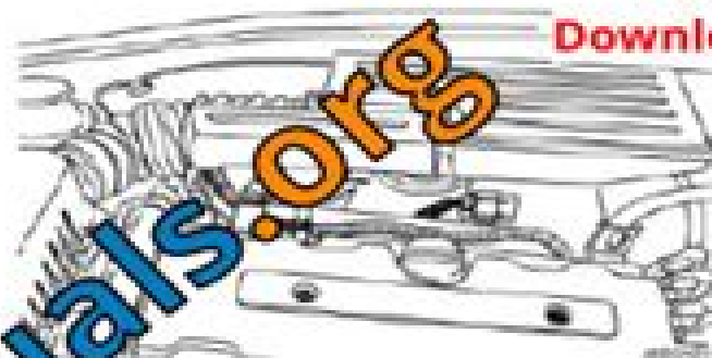
Fig. 39: Identifying Breather Tube To Camshaft Cover (L.O.C.)