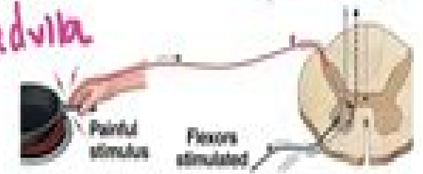
See video on p. 101