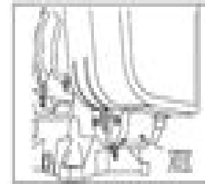
Fig. 1 - Typical Inboard engine

Fig. 1 and Fig. 2 show typical starter motor location.