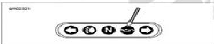
Figure 3-8. Oil Pressure Indicator Lamp

To troubleshoot the problem, always check the engine oil level first. If the oil level is OK, determine if oil returns to the oil pan. If oil does not return, shut off the engine until the problem is located and corrected.