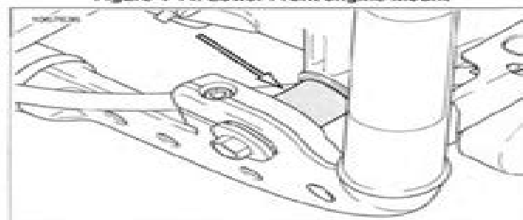
Figure 4-15. Spacer Installed Properly