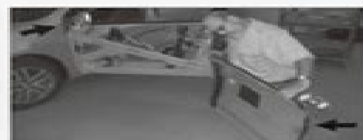
Outer door panels are removable for servicing components inside door cavity. 07 Doors and Central Locking