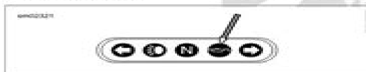
Figure 3-12. Oil Pressure Indicator Lamp

To troubleshoot the problem, always check the engine oil level first. If the oil level is OK, determine if oil returns to the oil pan. If oil does not return, shut off the engine until the problem is located and corrected.