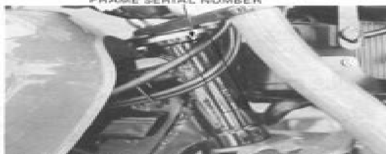
FRAME SERIAL NUMBER

The frame serial number is stamped on the steering head right side.