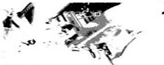
1. Tilt rod