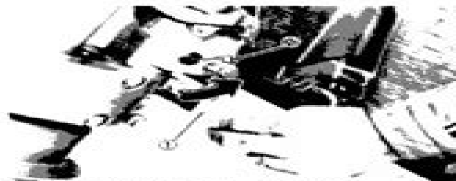
1. Shallow water drive lever 2. Stopper