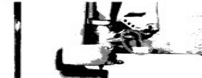
1. Normal position

This system allows cruising in shallows by inclining the outboard motor 20 degrees, although previously this was not possible.