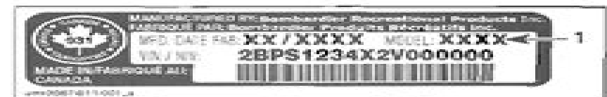
1. Model number

The Vehicle Model Number is scribed on vehicle description decal.