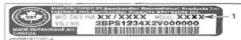
1. Model number

The Vehicle Model Number is scribed on vehicle description decal.