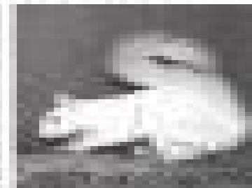
Figure 1: Electrophoresis gel showing LDH gene pool results.