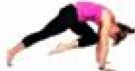
Knee to nose