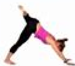
Knee circles (step 1)