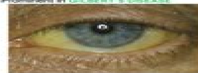
Figure 3. Jaundice (superior view)