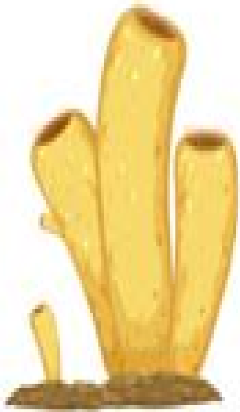
No Symmetry (eg. Porifera)