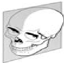
The skull (Sagittal section)

Coloring guide suggestion When coloring, use same color to indicate similar parts