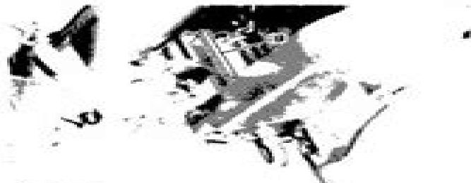
1. Tilt rod