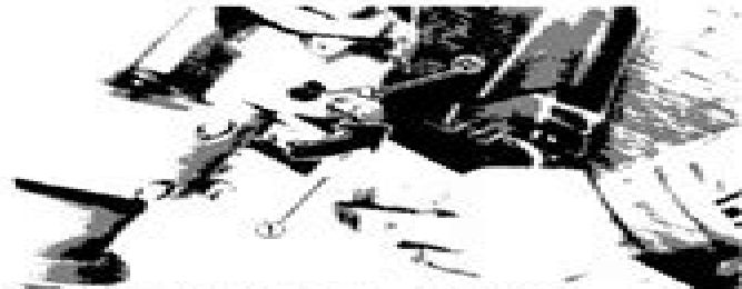
1. Shallow water drive lever 2. Stopper