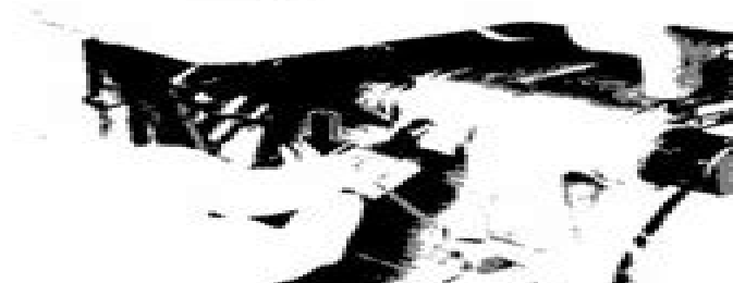
1. Tilt lever