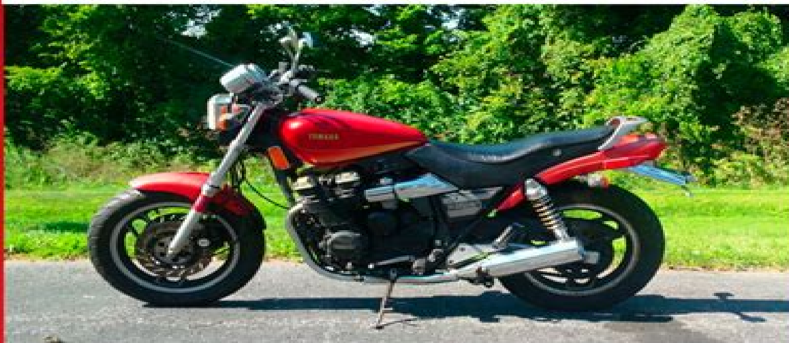
Yamaha YX600 Radian 1986 - 1990