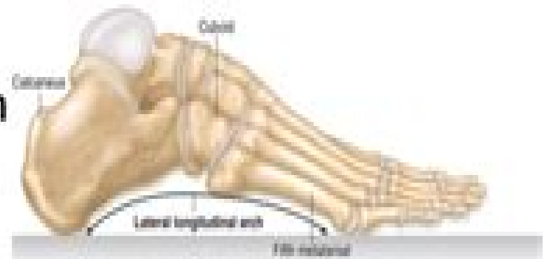
(b) Right foot, lateral view