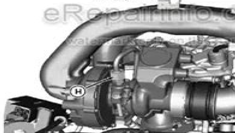
Oil Supply Line Nut