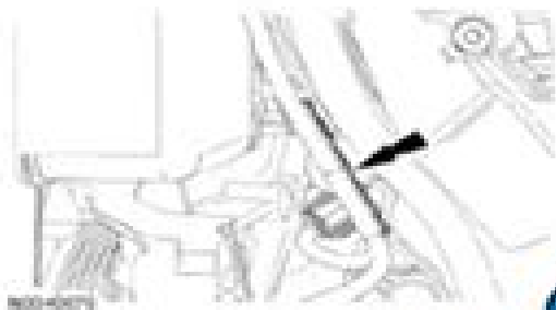
Fig. 10: Locating Electrical Connector Pin-Type Retainer

Detach the electrical connector pin-type retainer.